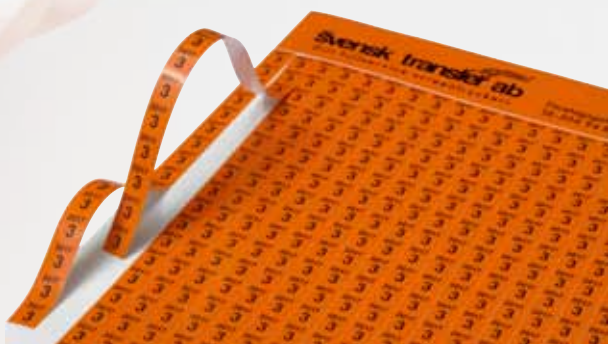
Strip with monthly and annual number of expiration, 9 x 180 mm.