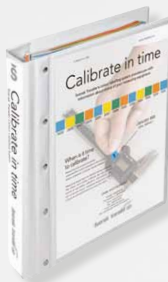
Binder containing a complete labelling set of sheets in the colors blue, yellow, green and orange indicating number of expiration month. Article number 1500

Our labelling system is an important part of the quality work. We offer a complete binder containing 48 sheets in the colors blue, yellow, green and orange indicating number of expiration month. As a complement we offer single sheets with labels indicating last year of use. For companies and calibration facilities with a high consumption, the labels are also available on rolls which may be supplemented with a special dispenser and holder containing stackable decks. The rolls indicate both month and year. Associated to the labelling system we have information posters in A4 and A2 format showing the relationship between colour and year.