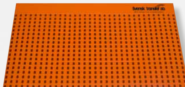
One sheet contains 594 labels, 9 x 10 mm.